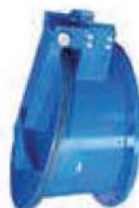
Material : CI / DI