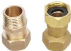
MALE FEMALE CONNECTOR

Material : DZR Brass CP Size : 1/2" to 4"