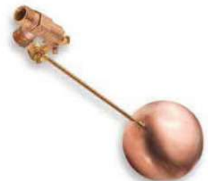
Size : 3/8" to 2 Material : Bronze