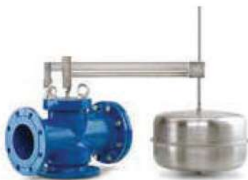
Material : CI / DI