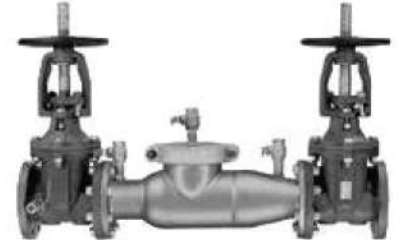
Material : Stainless Steel