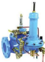
ATTITUDE CONTROL VALVE