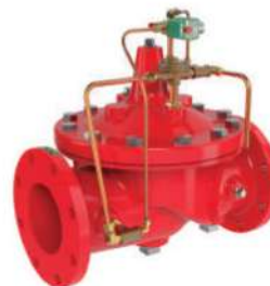
SOLENOID CONTROL VALVE