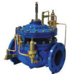
PRESSURE REDUCING VALVES