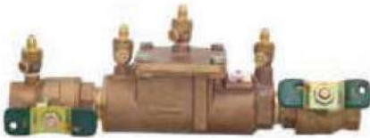
Material : Bronze