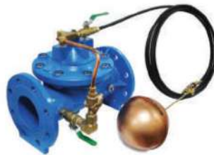
FLOAT CONTROL VALVE