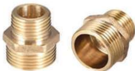
MALE REDUCING NIPPLE CONNECTOR

Material : EPDM SS Braided Size : 1/2" to 2"