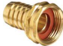
FEMALE HOSE CONNECTION

Material : DZR Brass CP Size : 1/2" to 4"