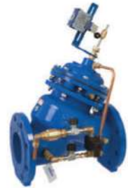
CHECK CONTROL VALVE