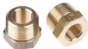
MALE FEMALE REDUCER

Material : EPDM SS Braided Size : 1/2" to 2"