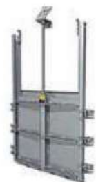
Material : DI / SS Size : 200X200 / 2000X