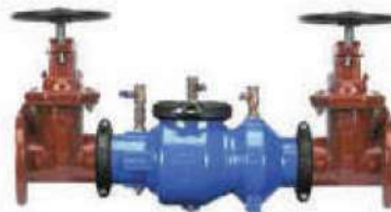
Material : Cast Iron