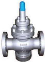
DIRECT ACTING PRESSURE REDUCING VALVES