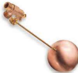
Size : ½" to 6 Material : Bronze