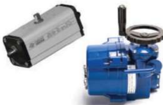
PNUMATIC / ELECTRIC ACTUATOR