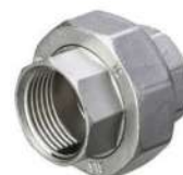
FEMALE FLAT SEAT UNION